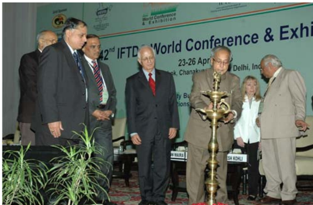
The Conference was inaugurated by the President of India Mr. Pranab Mukherjee by lighting the traditional lamp.

The eminent speakers in the first Plenary on the 24th April on 'Emerging Corporate landscape' mapped the challenges in the business extent, the changing scenario, intensity of competition, complexity and diversity and increasingly global environment.